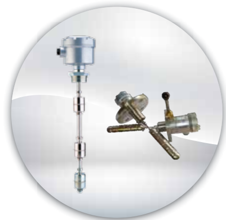
Float Level Switch