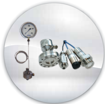
Level & Pressure Sensor