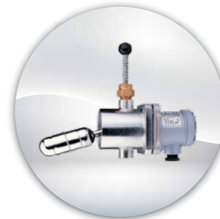
Float Level Switch