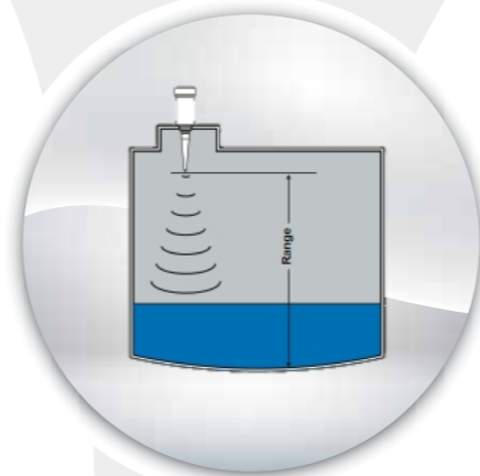
Radar & Ultrasonic Sensor